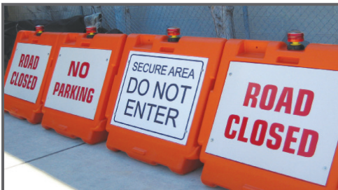
MB42x45 O LCD with adapters and C01's.