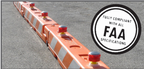
AR10x96 V.2 with C01's.