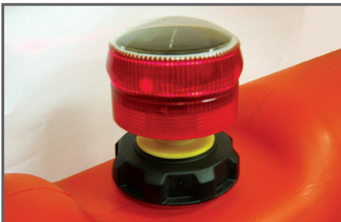
C01 light with adapter on AR24x96 V.2.