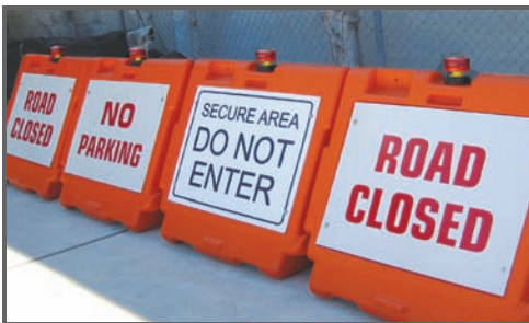
MB42x45 with adapters and C01's.