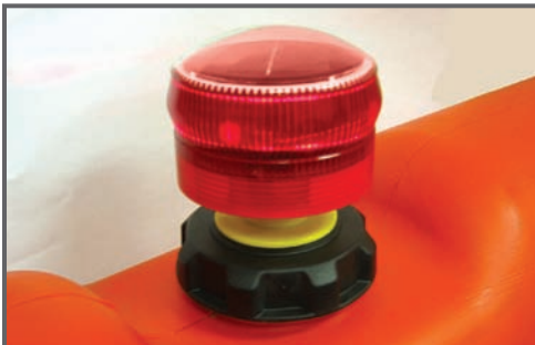
C01 light with adapter on AR24x96.