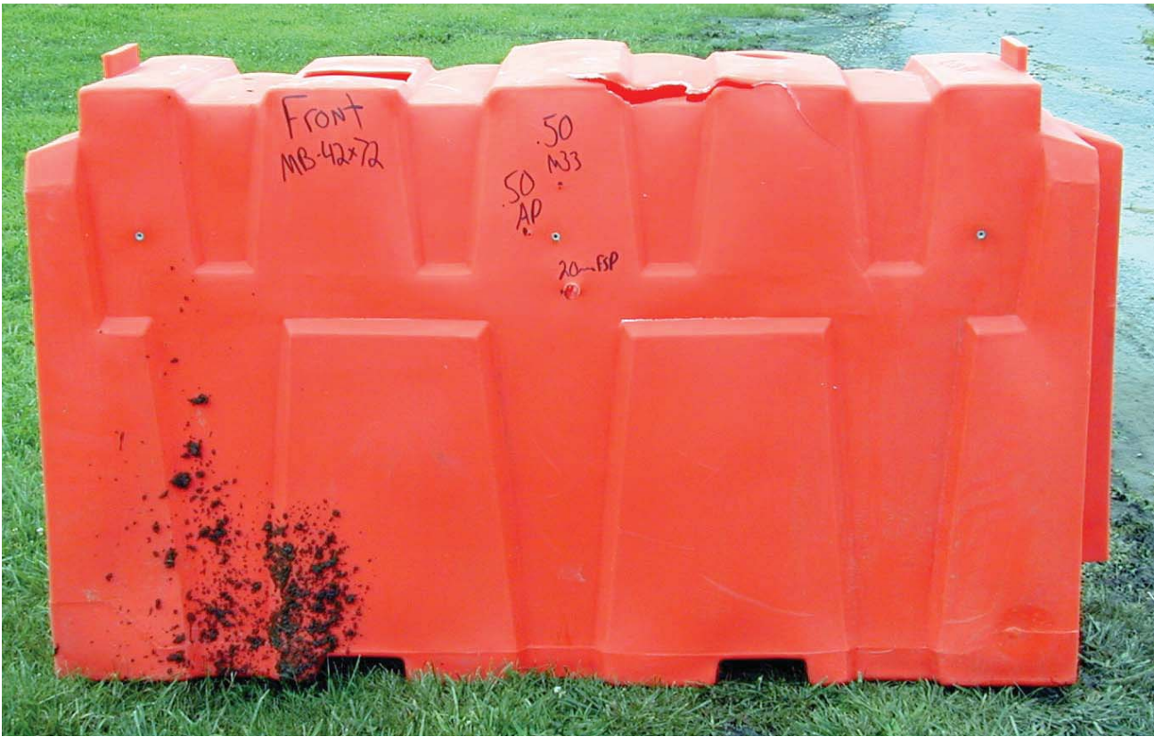
MB42x72 King Tut